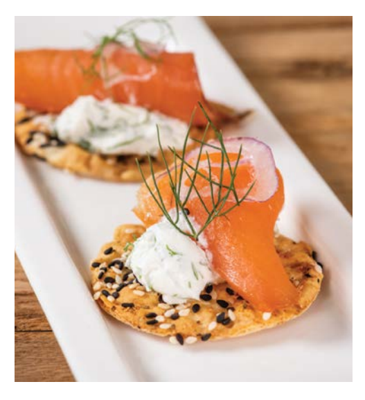
8 SPRING MARCH-MAY