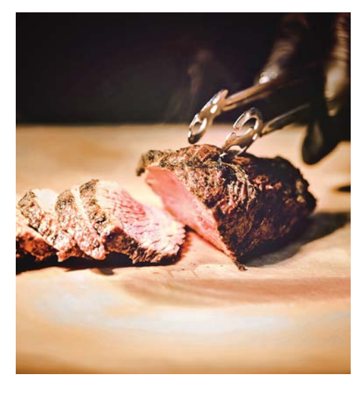
6 WINTER DECEMBER-FEBRUARY