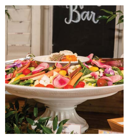
4 YEAR-ROUND DIPS, DISPLAYS AND STATIONS