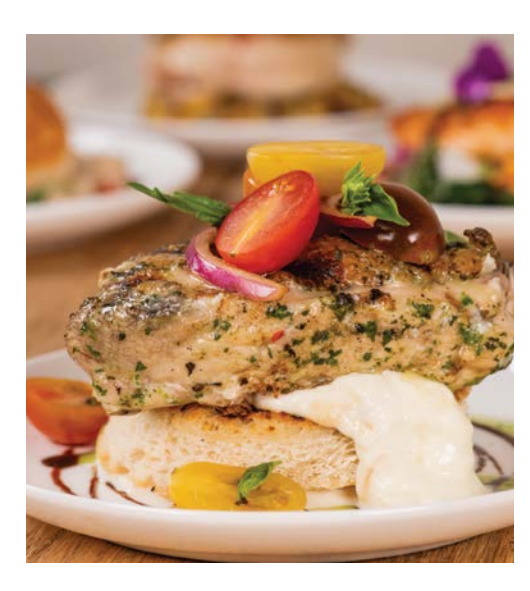
10 SUMMER JUNE-AUGUST