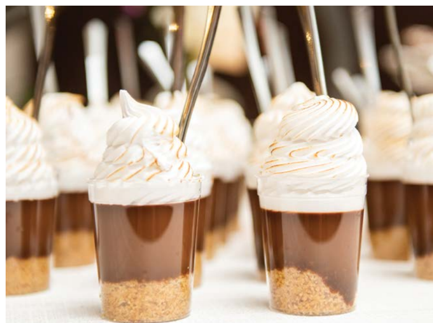
PAGE 16 // ROCKYTOPCATERING.COM

DONUT FLAMBÉ plain and chocolate donut holes flambéed with brown sugar, butter, rum and orange juice. Served with vanilla ice cream.