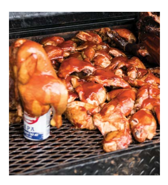
14 BARBEQUE ENTRÉES AND SIDES