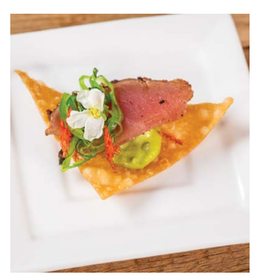
12 FALL SEPTEMBER-NOVEMBER