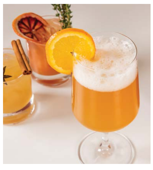
18 BAR PACKAGES AND SPECIALTY