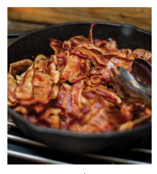
15 BREAKFAST/BRUNCH STATIONS AND BUFFETS